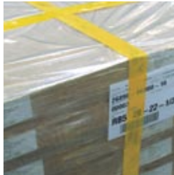
Securely sealed pallets using tesa® 64008 tamper-evident sealing tape.

This allows you to identify weak points in the logistics chain, so the necessary measures can be taken.